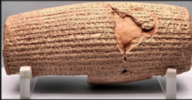
Fig. 8 Cylinder of Cyrus

The following is a translation of a section describing the invasion of Cyrus and his armies into Babylon, but ascribing his success to the god Marduk.