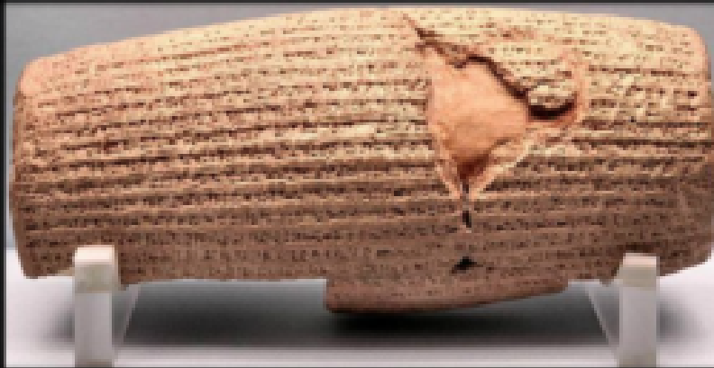
Fig. 8 Cylinder of Cyrus

The following is a translation of a section describing the invasion of Cyrus and his armies into Babylon, but ascribing his success to the god Marduk.